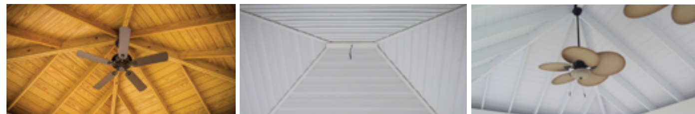
Stained Wood (Standard)