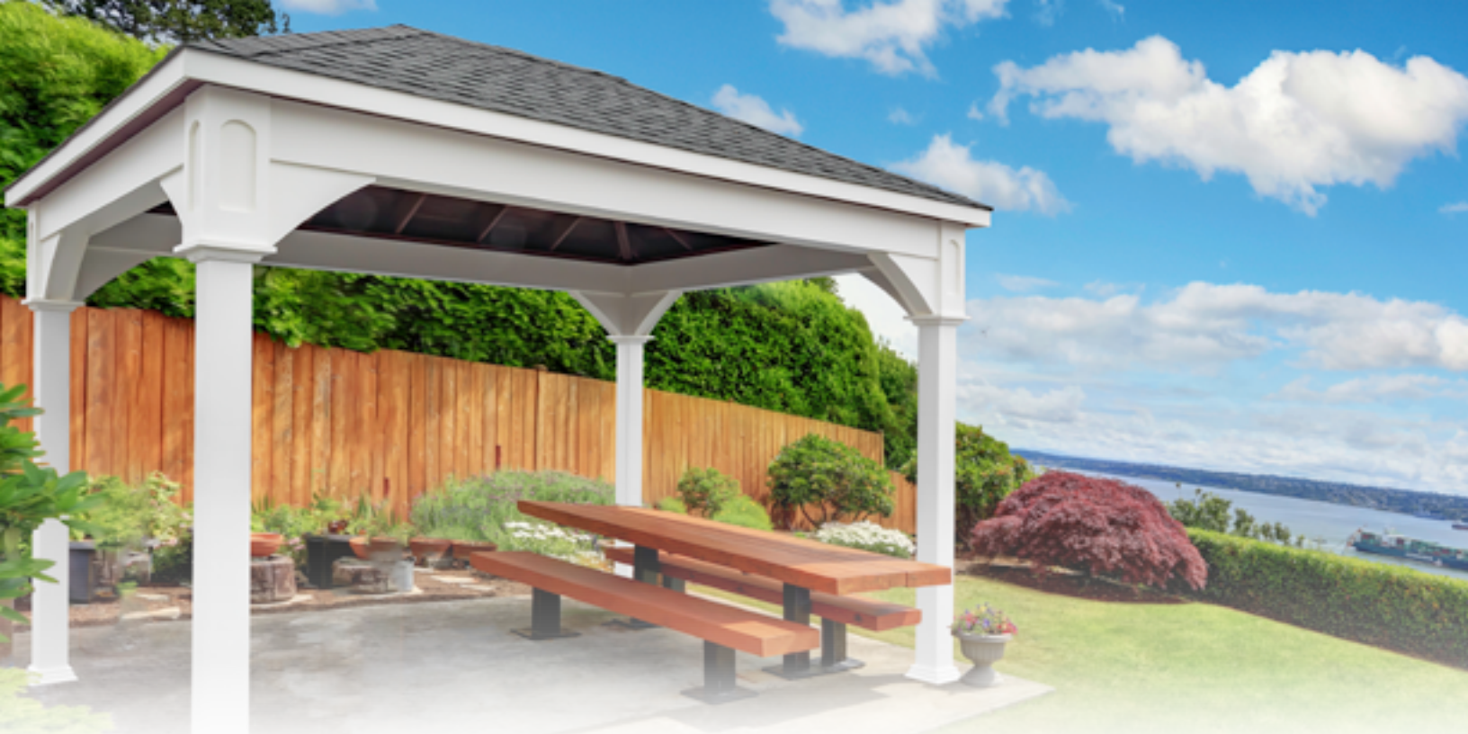
STANDARD VINYL PAVILION