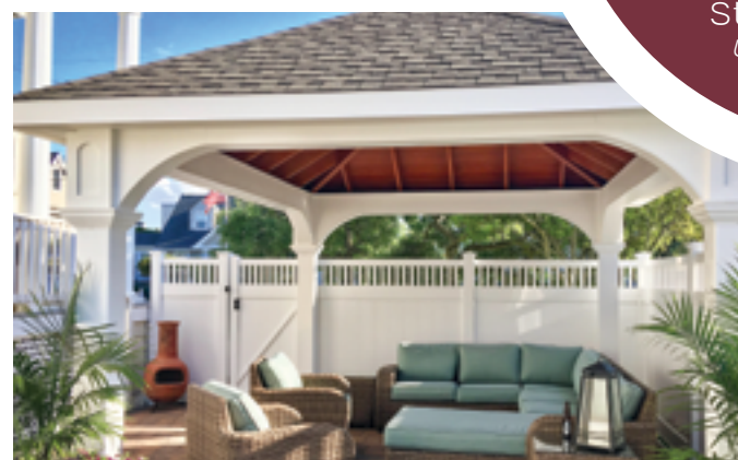
LUXURY VINYL PAVILION